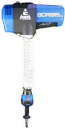
Gorbel G-Force Lifting Device

In the final design, the gearbox provides the required torque to the lift through a rotating housing that acts like a powerful driven pulley. “The GAM components allowed us to achieve our goal of doubling capacity while using standardized components across the line,” McNeil states. Functionally, McNeil adds, the G-Force devices provide fast, precise servo-controlled lifting without any valve changes. With lightweight jobs, the product competes against manual lifting and workers won’t use it if it slows them down. At higher capacities – engine assemblies, for example – G-Force lifts may be required to place 400 to 500 lb. pieces together very precisely. “You can’t risk damaging expensive parts or causing a crushing injury to an operator’s hand,” McNeil notes.