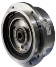
Custom EPL Gearbox for Gorbel